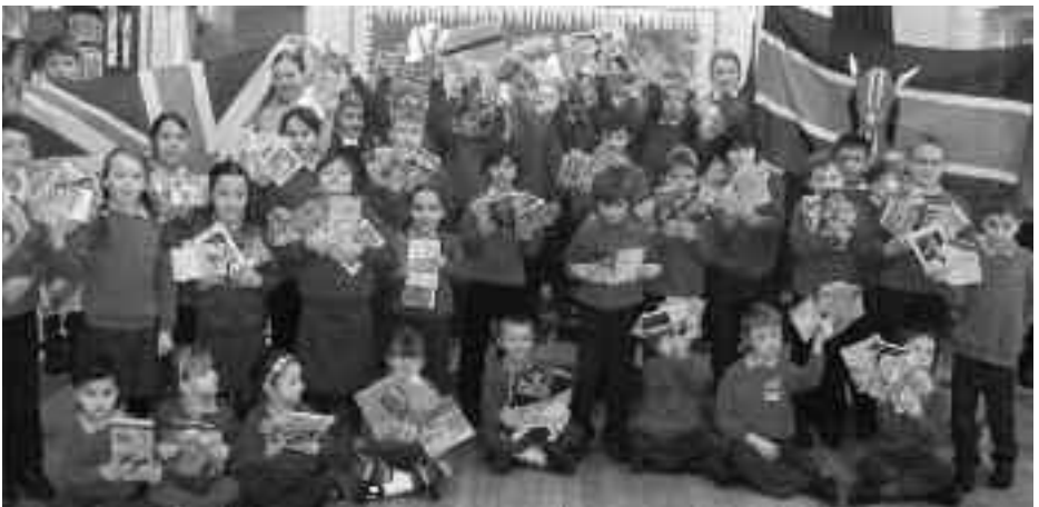
Photo taken at Mendham Primary School.

The Waveney Valley Partnership of schools and the local Scout Group work together on a number of projects that extend and enhance the curriculum and opportunities for our children. Many pupils at the schools are also active members of the scout group.