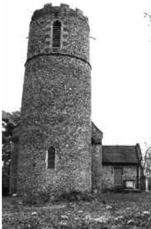
Syleham Church on the day of the Snowdrop Walk