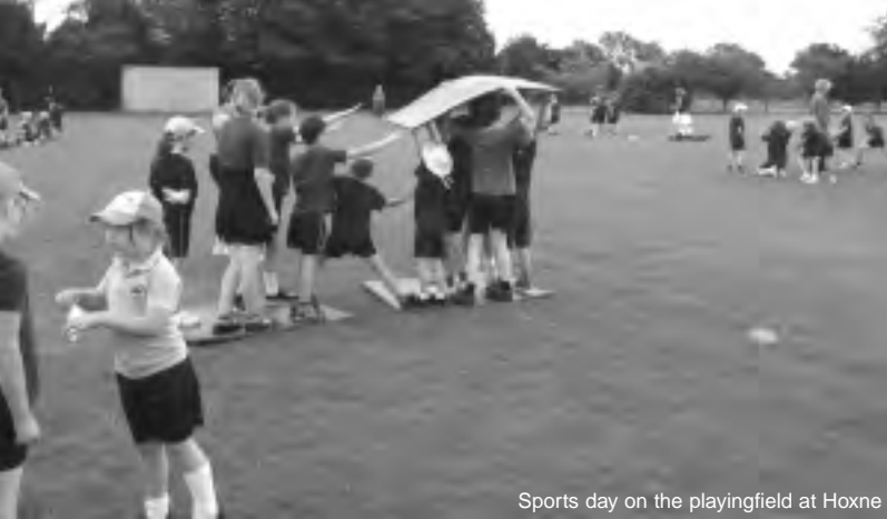
Sports day on the playingfield at Hoxne

above the playground. We are sadly having to bid farewell to our Year 6s who will be heading off to big school in September; we wish you all the success you all deserve. We also